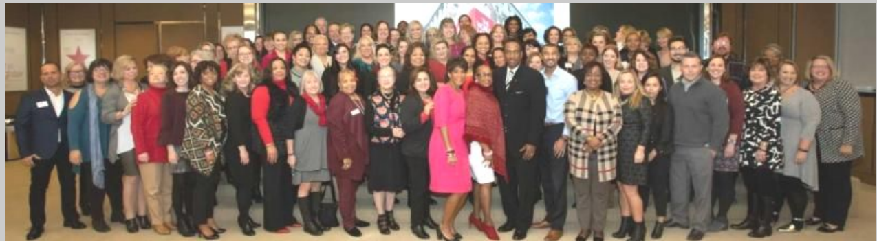
Regional Holiday WBE Forum Luncheon hosted & presented by Macy's, Inc.

CLICK HERE to download 2019 Quarterly WBE Forum Luncheon Schedule (all dates are subject to change).