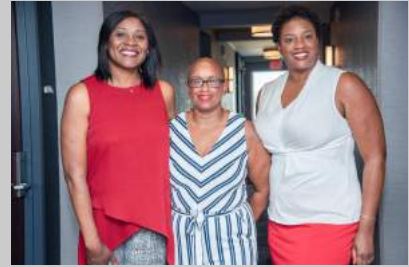
RPO Leading Ladies