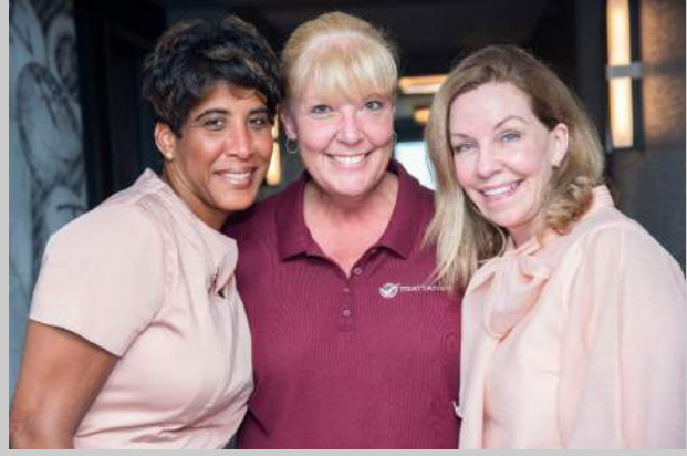
WBEC ORV, WBEC West & WBEA Stars