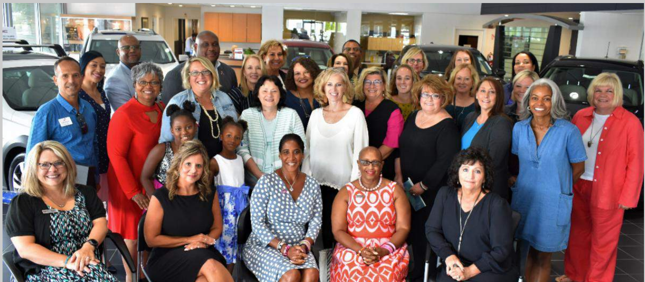
Dayton WBE Forum Luncheon Hosted by Bob Ross Auto Group

CLICK HERE to download Quarterly WBE Forum Luncheon Schedule (all dates are subject to change).