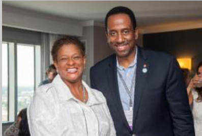
Cintas & Macy's SD Leadership