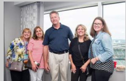
RPI Graphic Data Solutions Ready to Make Things Happen