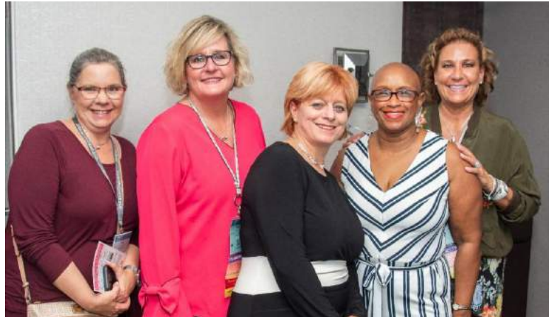
The ladies of ORV at National Conference Reception

We're halfway through the year, so it's time to reflect on your learnings so far for 2019 and to position yourself for growth in 2020. Just as school starts for kids across the country, as business owners, you should identify ways that you and your leadership team can solve problems and transform the way you do things, which often requires looking at your business through a new lens.