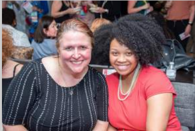
TOYOTA Showing Their Support