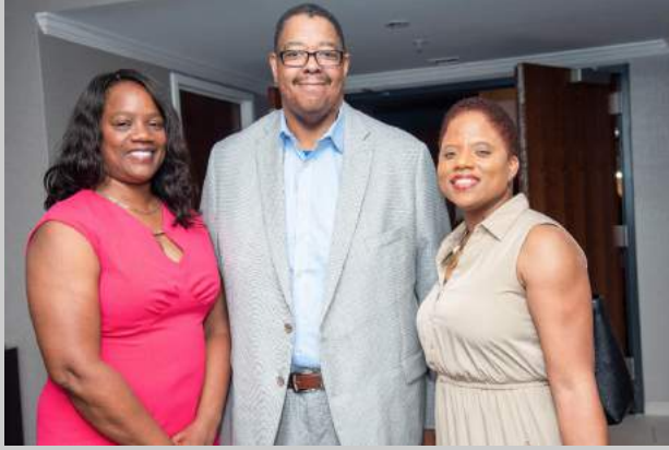
Honda's Supplier Team Sponsored Reception